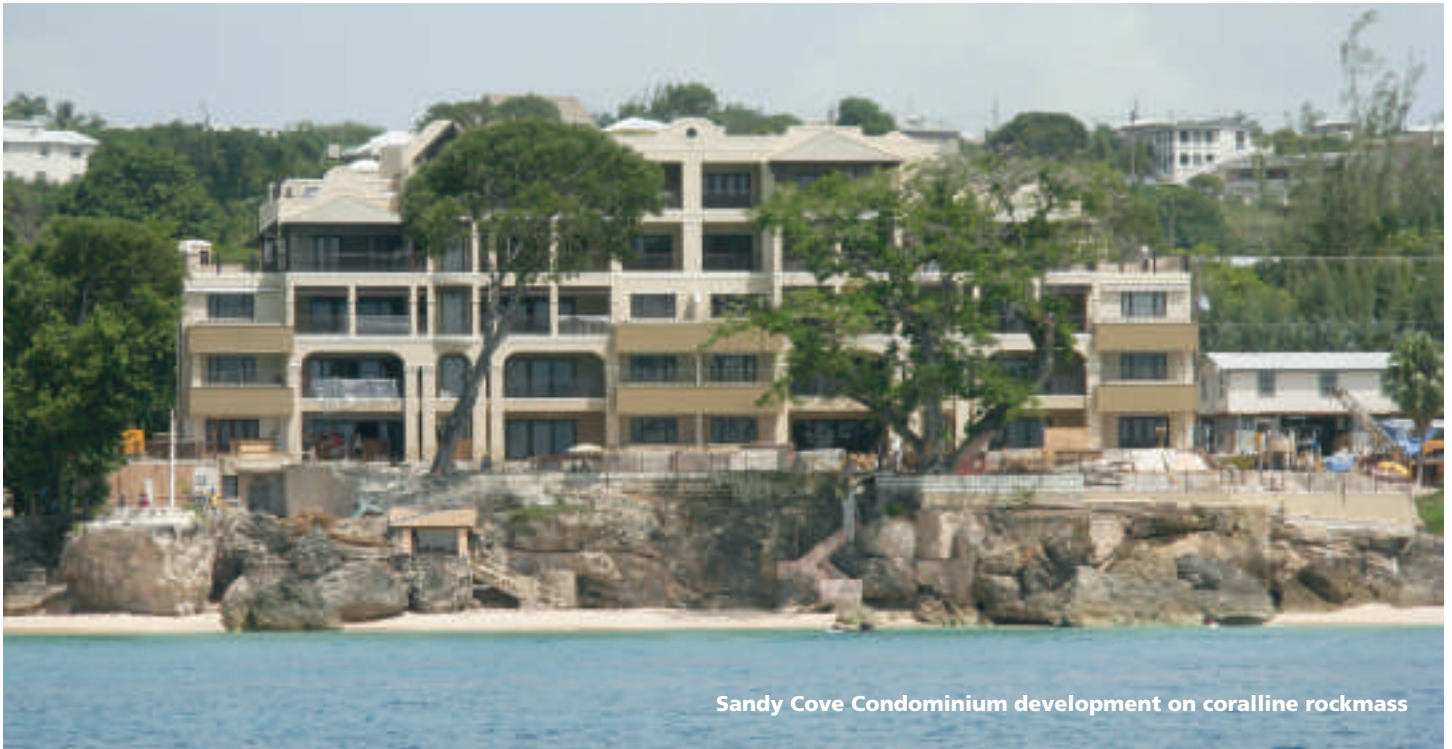
Sandy Cove Condominium development on coralline rockmass

The west coast of Barbados is home to platinum white beaches, the sparkling Caribbean Sea, the rich and famous, and some extremely challenging foundation conditions. The island largely comprises coralline limestone formed in terraces up to 260 ft (80 m) thick; the remains of ancient coral reefs. While technically rock, this coralline limestone has strength so low in many places that its properties approach that of a hard soil. The coralline rockmass behaviour as a foundation stratum is further complicated by the presence of relict rock fabric, incipient fracturing, numerous voids, fissures and joints. The rockmass, however, can contain an indurated or hardened cap present in various areas including along shorelines in the crest zones of cliffs.